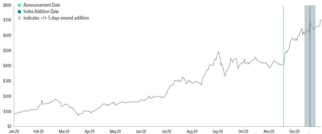
Tesla Daily Stock Price: January 1, 2020 through December 31, 2020